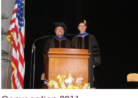
Convocation 2011 PAGE 4